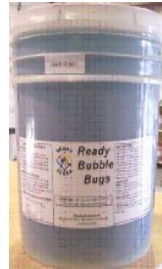
5 Gallon Pail

Liquid Cleaner With Hydrocarbon Digesting Microbes