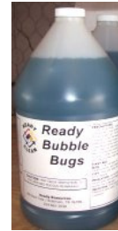
1 Gallon Jug

Ready Bubble Bugs is a registered E.P.A. certified cleaner loaded with hydrocarbon digesting enzyme producing microbes.